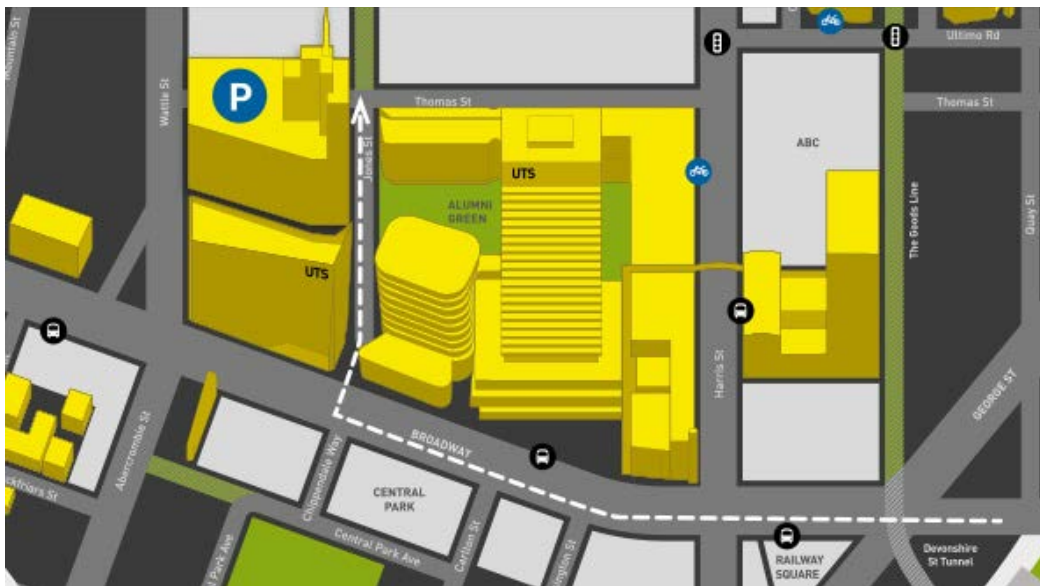
Figure 2: Parking Map